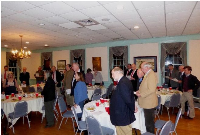
We had an audience of thirty people in attendance